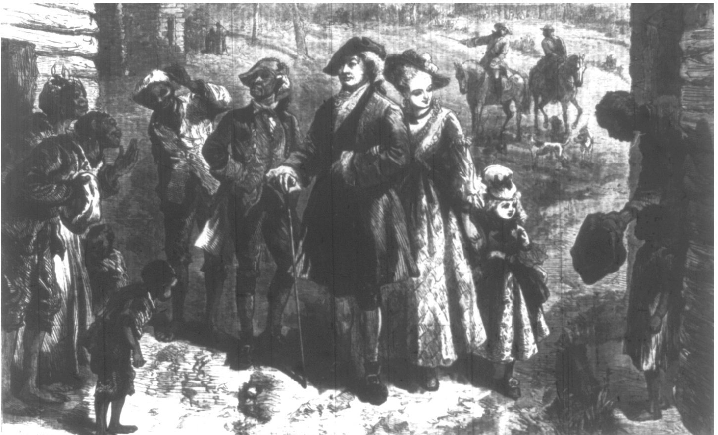
SLAVERY IN COLONIAL AMERICA

George Whitefield was no perfect man. Undoubtedly the most glaring flaw in his life was that he not only owned slaves, but he encouraged slavery's introduction in colonial Georgia, where it was originally banned. Evidence even suggests that Whitefield allowed slaves to come to his Bethesda property in Georgia before the colony had actually made them legal, although Whitefield denied doing so.