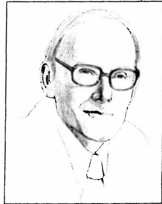
Clark H. Pinnock

This struggle for control will coalesce around the definition of evangelical . With the growing prominence of non-Augustinian interpretations within the evangelical camp, how will the “powers that be” respond? Politically, evangelicals prefer democratic pluralism, but it remains to be seen if they will exhibit tolerance toward this new diversity in the forefront of their ranks. □